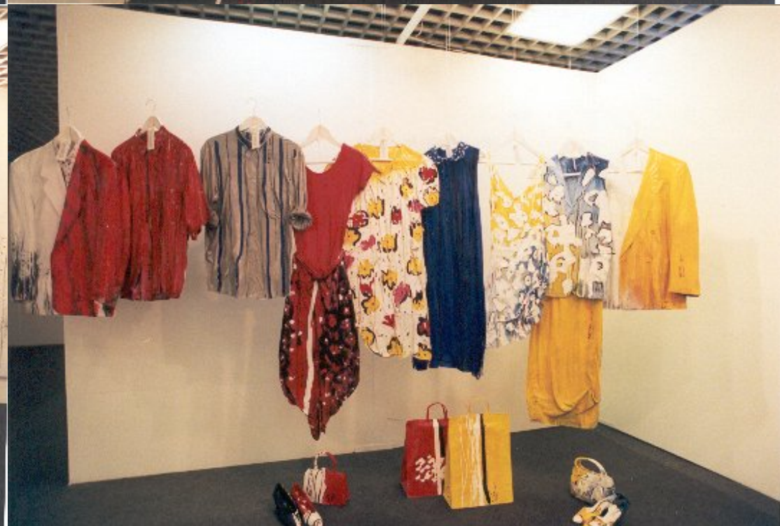
'Clothes & Sarong', 1999 mixed media – installation, private collections, Athens, Greece – Limassol, Cyprus – Rome, Italy